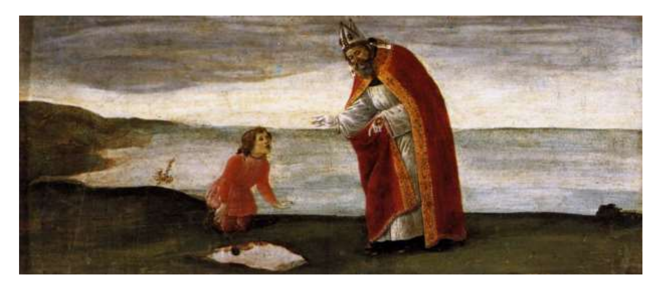
"The Vision of St Augustine" by Sandro Botticelli.